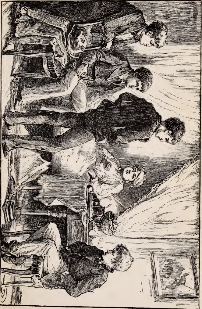
JACK RECEIVES HIS FRIENDS.